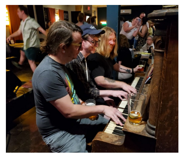
The more the merrier! Whirlybirds band folks having way too much fun on the piano!

All levels of experience are welcomed on the bandstand and the dance floor. It's a fun and informal evening sharing this music and dance we all love! MUSICIANS: visit the "Learn it + Play it" page on www.COHJS.org for Jam tips and learning resources. So dust off that instrument, or come sing a song. Bring your dancing shoes!